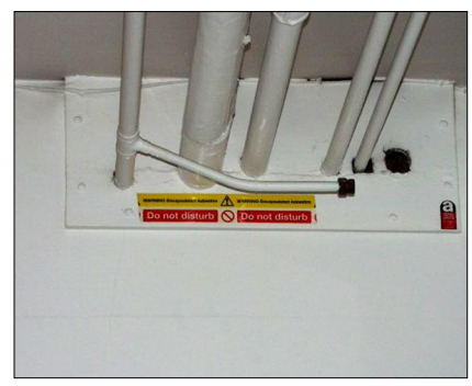
Don't assume there will always be warning signs. There could be undiscovered asbestos in buildings you work on.